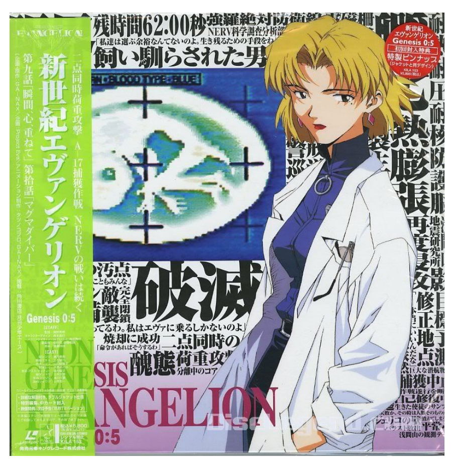
The typeface is called Ryumin.