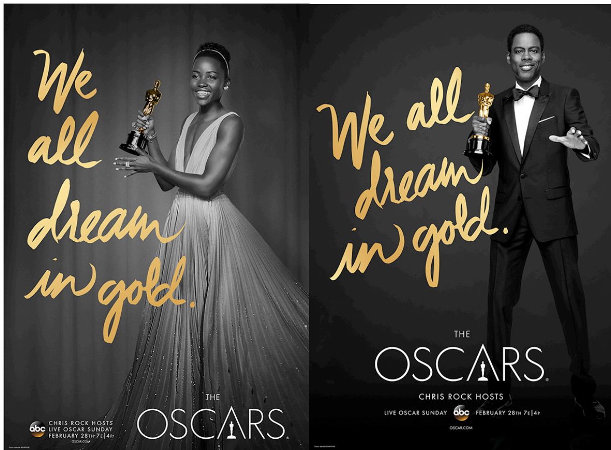
This was the design campaign for the 88 th oscars