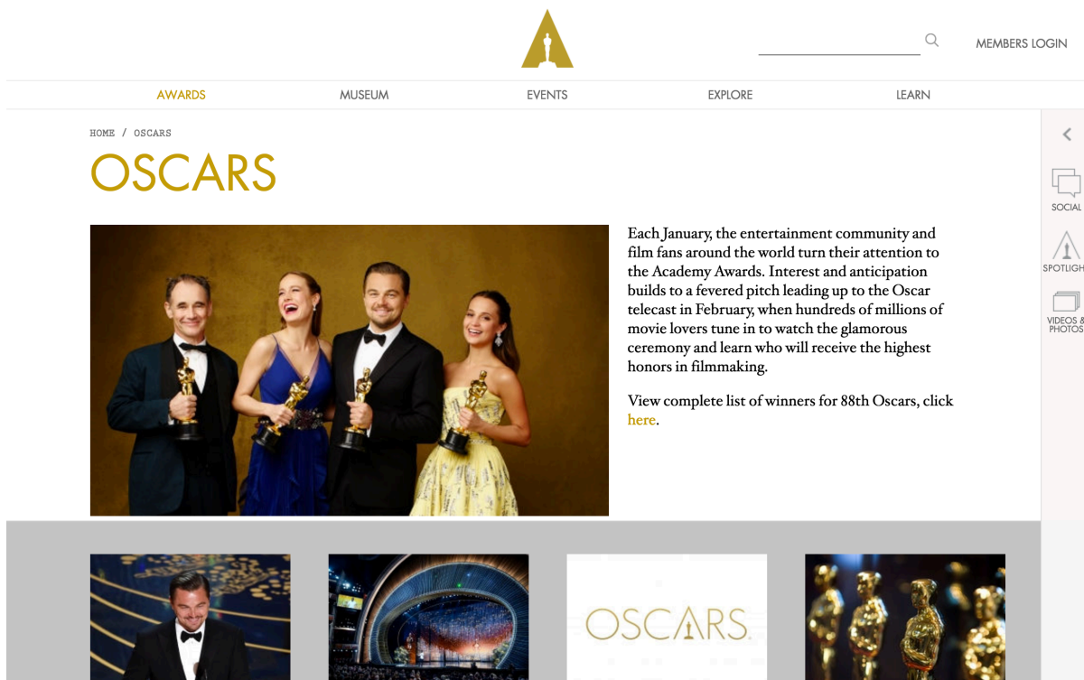
This is the official Oscars/academy website